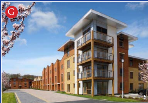
884 Units Crawley, Surrey