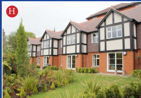
40 Units Tunbridge Wells, Kent