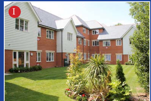
60 Units Brentwood, Essex