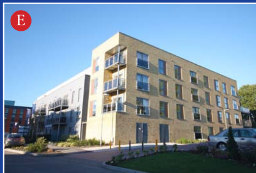
67 Units Earlsfield, London