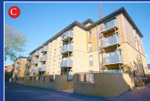
157 Units Bermondsey, London