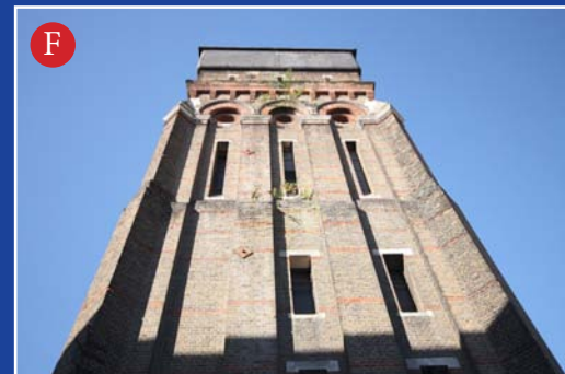
113 Units Lambeth, London