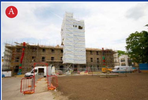
360 Units Croydon, Surrey