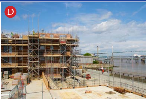
214 Units Greenhithe, Kent

A selection of our current projects from small individual blocks to developments containing several hundred units. The larger developments are likely to have several different types of tenure from private flats and houses to flats and houses owned by housing associations and commercial units and retirement blocks.