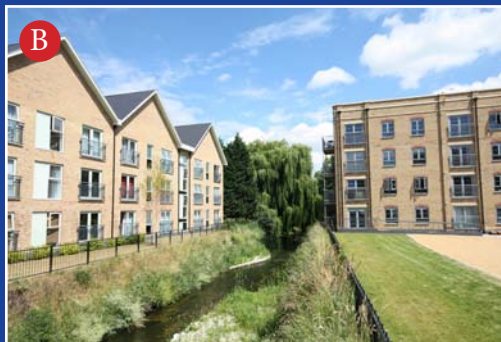
223 Units Horton Kirby, Kent